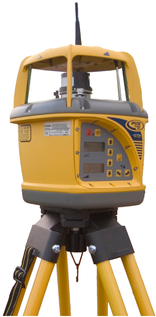
GL722 Grade Laser

For the GCS900 2D AND For the GCS900 3D with Laser Augmentation