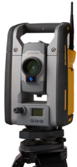
Universal Total Station